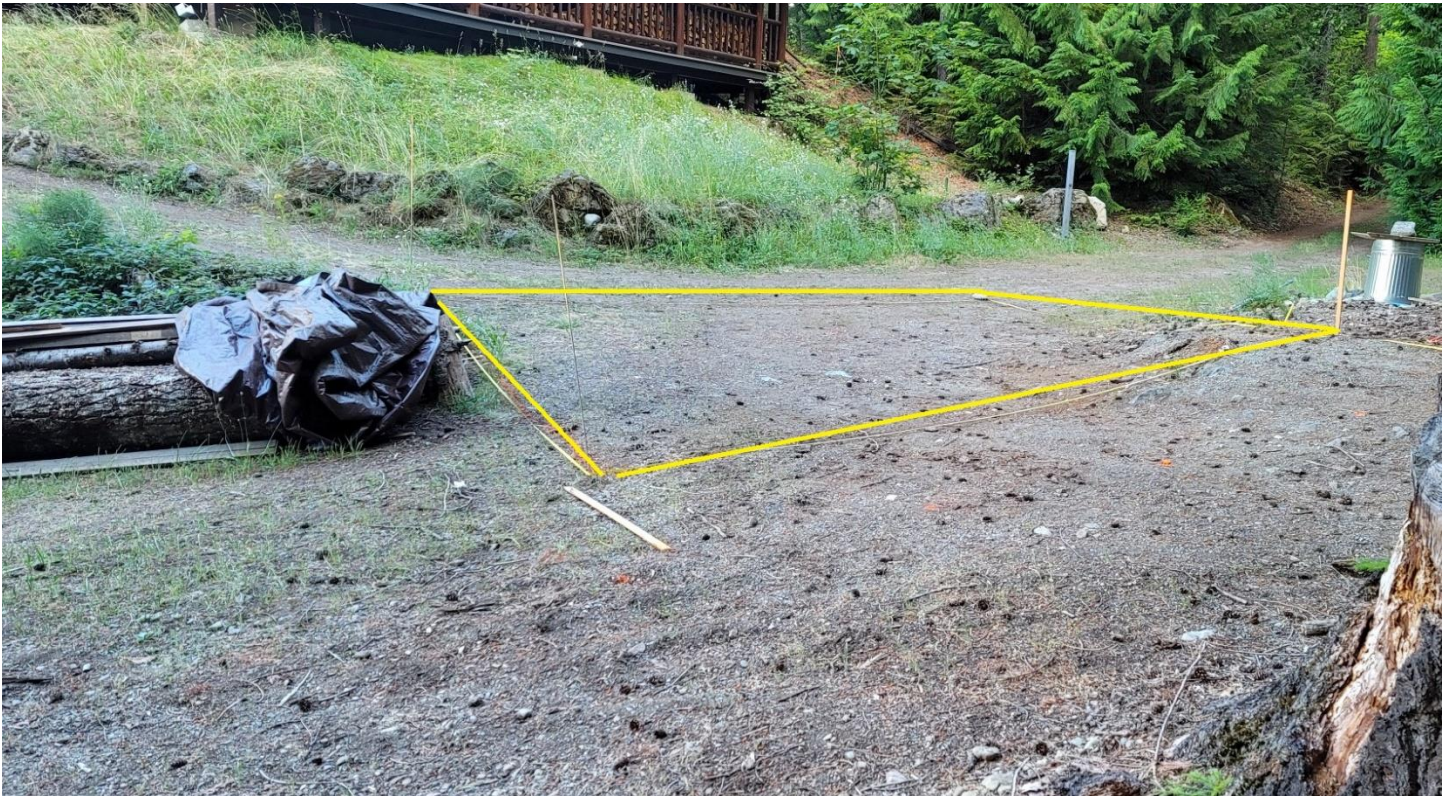
Looking back uphill towards the existing structure, showing existing road and access area.